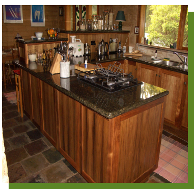
We welcome our new kitchen!